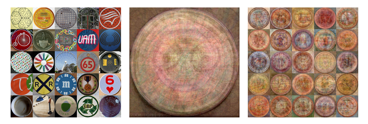
Figure 1 (left): 25 Images from Flickr's Squared Circle pool

Since 2005, in the early days of Flickr, the social photography sharing website, I've been playing with combining large quantities of images in various ways. Fairly early on I discovered a group called Squared Circle that pools photographs that have nothing in common except that the images contain a large circle that fills a square frame (figure 1). I produced a number of mosaics using these images (figure 7).