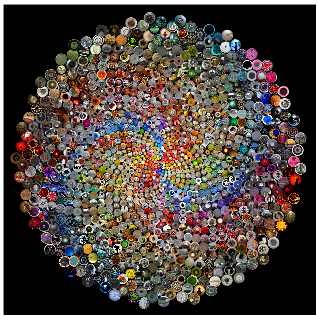
Figure 7: Mosaic produced from Flickr's Squared Circle pool.